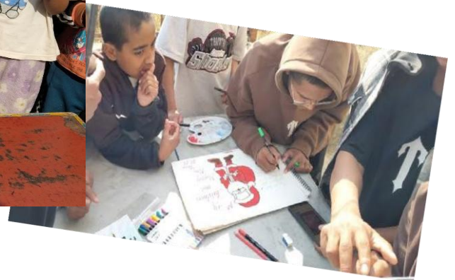
At Indreni, the children designed Christmas cards and rehearsed the song “We Wish You a Merry Christmas” again. And there was a Christmas cake for everyone: