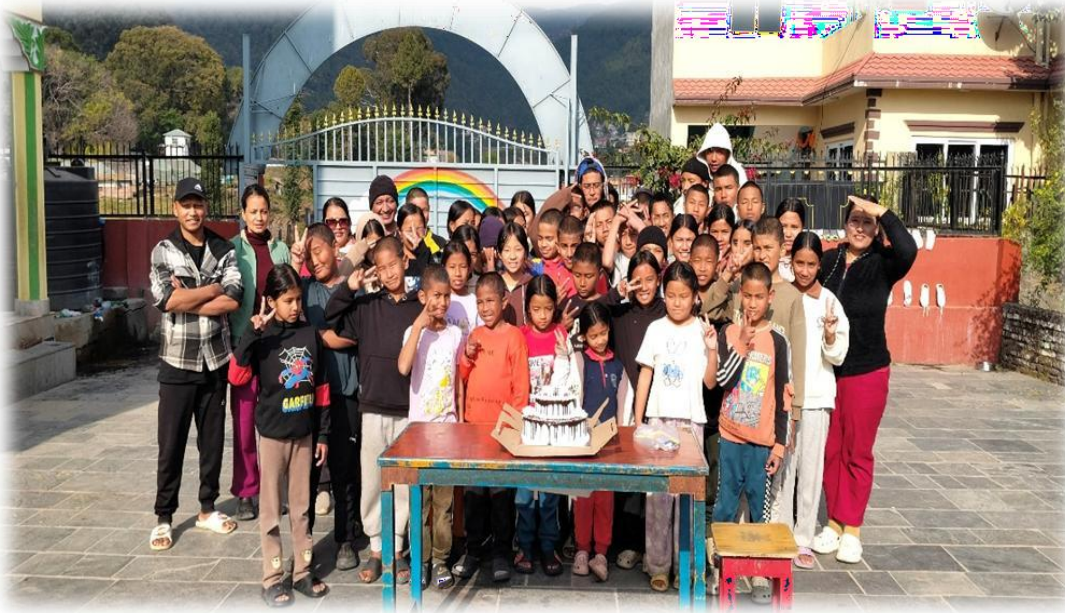
INDRENI Children Home, Sundarijal