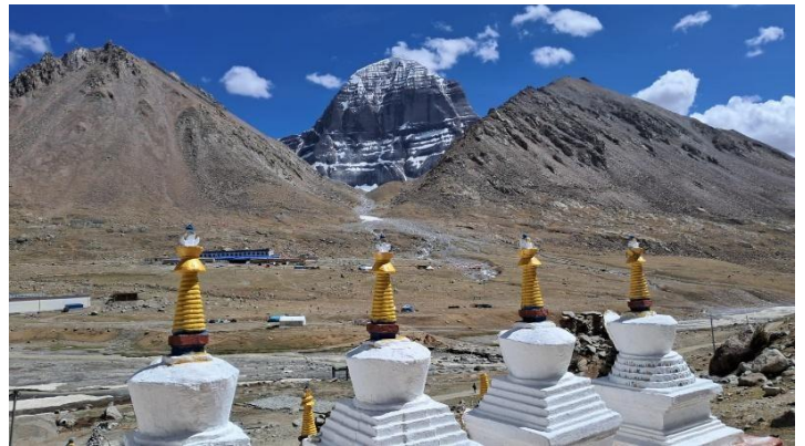
View of Mount Kailash in Tibet