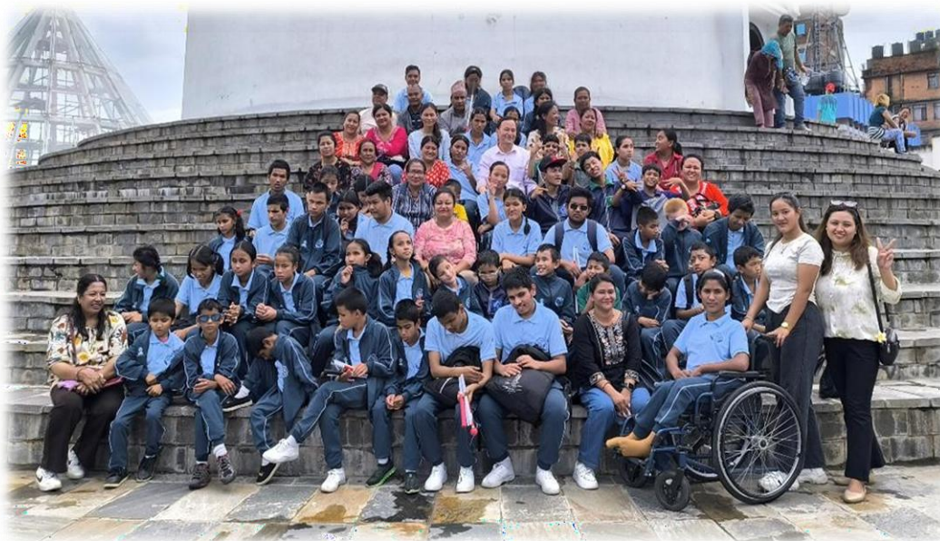
Disabled Service Association (DSA), Bungamati